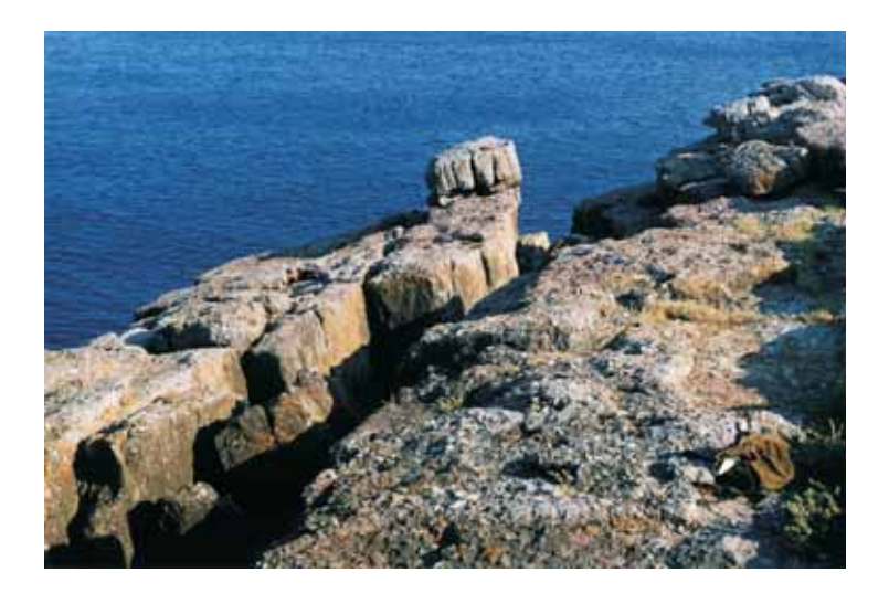
Fig. 7. A crack of tectonical breaking

Fig. 6. Characteristic selective denudation of aleurite-conglomerate rocks on the island