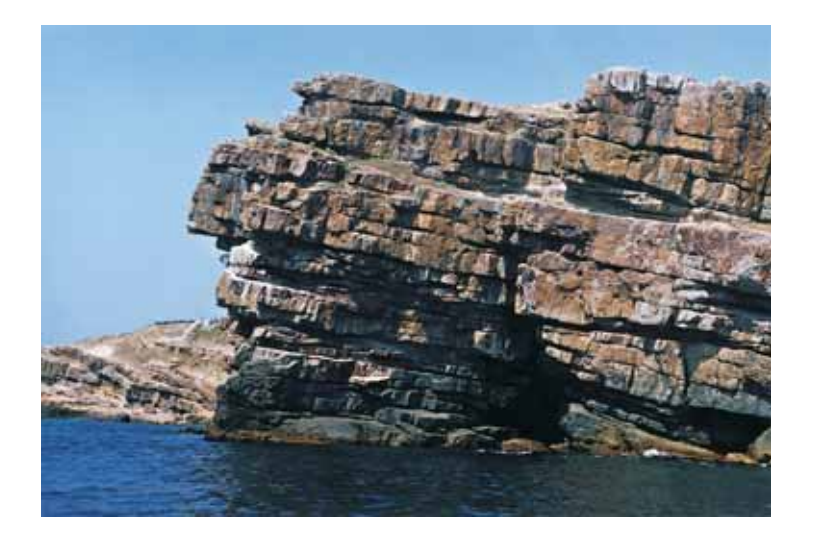
Fig. 2. Steep rocks in a south-eastern part of the island In the background appear many-coloured clays, sandstones and aeroliths

specula of sponges. This rock mass of 97 m of thickness is compared with the upper part of Jalpuchscian suite of Danube Predobrudja (Gedinnian stage).