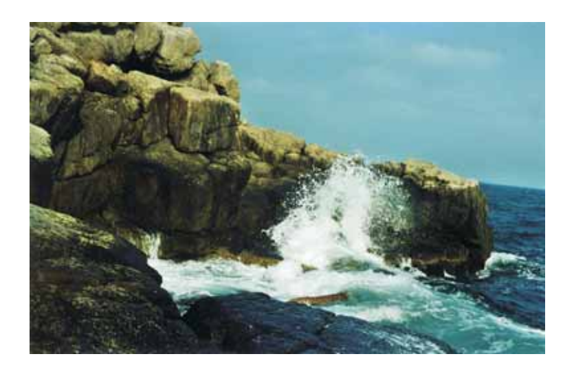
Fig. 5. Abrasion of rocky coast Snake in operation

It is not enough to make final conclusions concerning the age of the terrigenous formation of Zmeynyi Island's rocks, considering the great interval of divergence (from Lower to Upper Devonian) but the problem has been risen and demands solution.