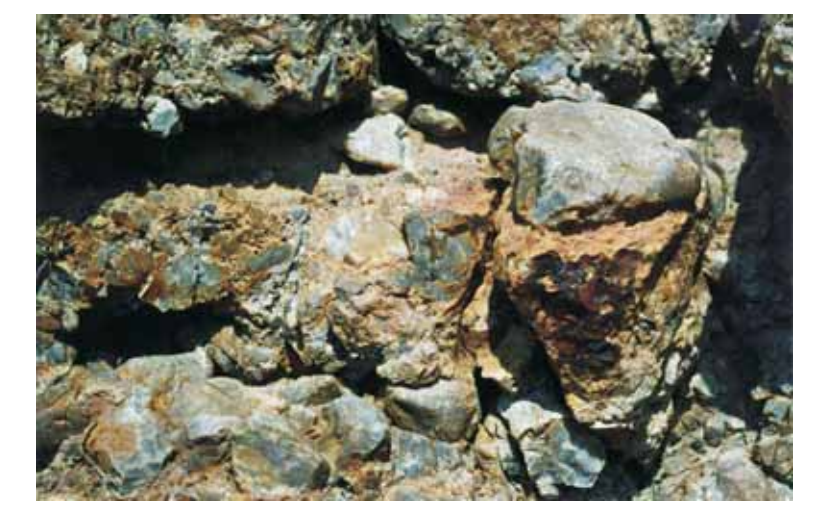
Fig. 1. Quartz-siliceous and quartzite pebbles and boulders with cavities of leaching

Besides, clay aleurite rocks also contain Pseudozygo bollina moldaviensis Trand. msc., Araucaria sp., a lot of shells