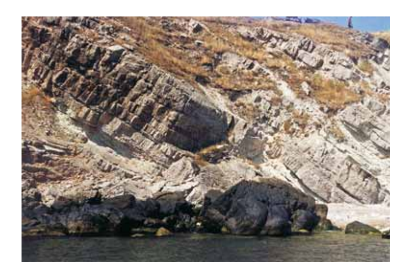
Fig. 4. Tectonical fracture in Devonian conglomerates

and siliceous rocks. Fragments of sandstones are fine grained and contain quartz grains of 0.05–0.5 mm in diameter as well as separate tabular grains of plagioclase, cemented by hydromicas cement of porous and at places of basal type.